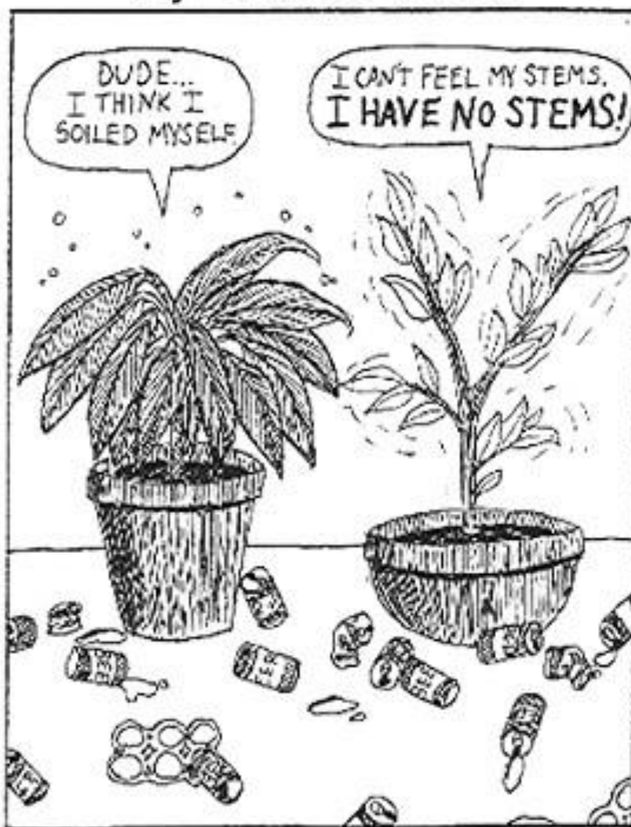
WHEN PLANTS GET DRUNK